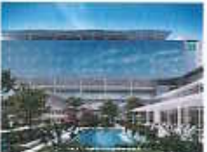
Location 3 - Courtyard/ Garden