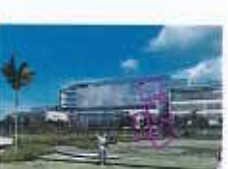
Location 4 - Oakland Park BLVD