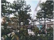
Location 2 - Pine Shade Garden at Main Entrance