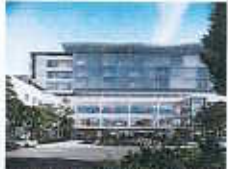
Location 1 - Main Entry Approach - East of Entry Drive